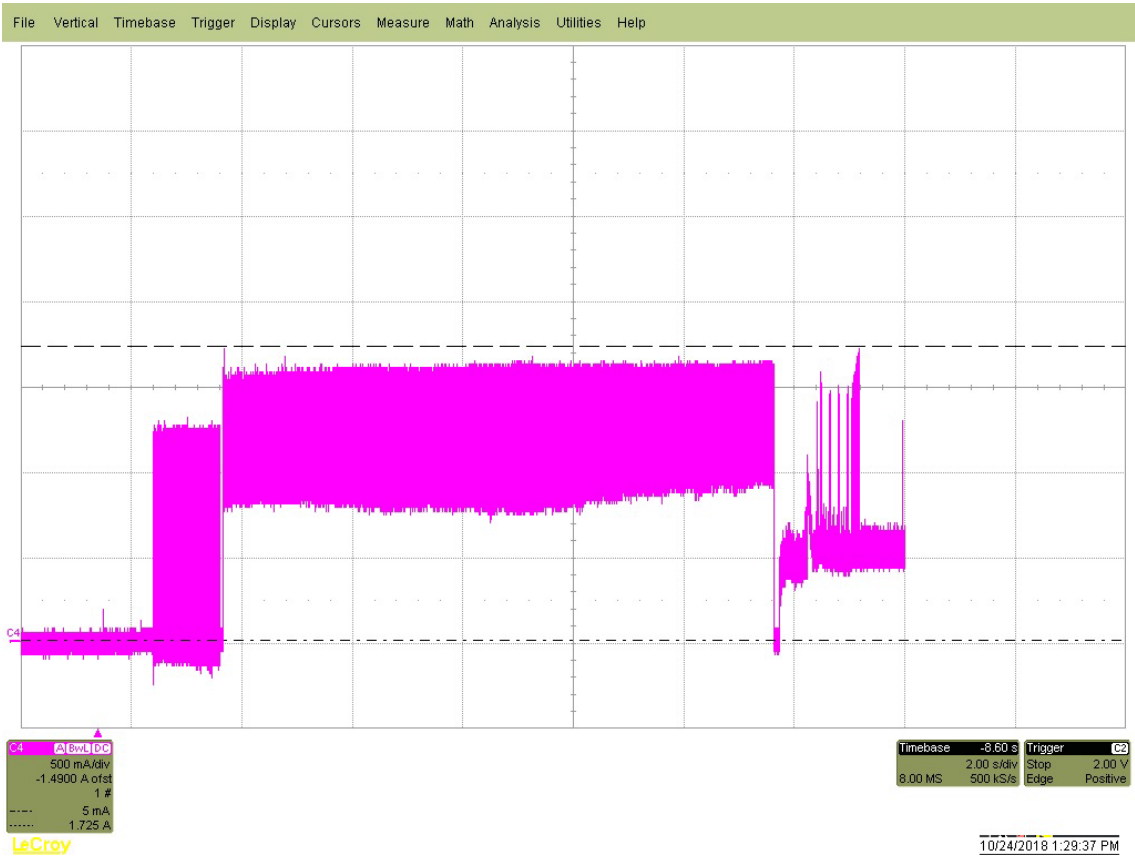
Figure 1. Typical 12V startup and operation current profile